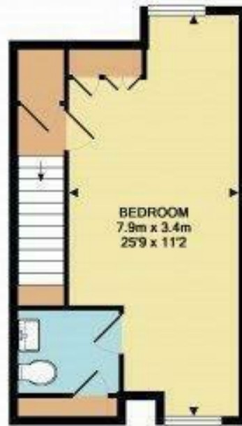
2ND FLOOR: APPROX. FLOOR AREA 32.7 SQ.M. (352 SQ.FT.)

8 MAGDALENE COURT, GIGANT STREET, SP1 2DL TOTAL APPROX. FLOOR AREA 112.1 SQ.M. (1205 SQ.FT.) Measurements are approximate. Not to scale. Illustrative purposes only. Made with Metropix ©2015